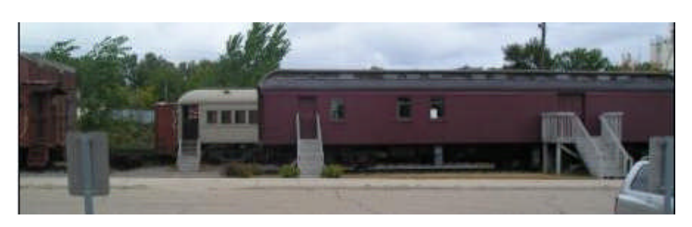
SPRC Special Event By Orcy Lyle, WØQT

An organization called "FISTS" <u>http://www.fists.org/</u> that pro-